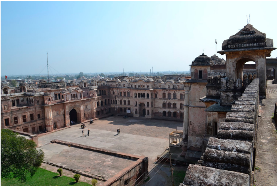
Figure 1. View from walls of the inner fort ( Qila Androon ) on the entrance gate and square of Patiala’s Qila Mubarak .

The most interesting Sikh reference to the Jain tradition that entered my mind was an image of the green-bodied Jain master, Arihanta Deva , in the Sheesh Mahal (Hall of Mirrors) of the Qila Mubarak in Patiala. (Figure 1) Similar to the Dasam Granth , the painted chambers of this huge fortified palace complex in the heart of the city represent a great example of the shared culture in which pre-twentieth century Sikhs and Jains lived. The fully decorated chambers, with frescos made by Rajasthani and Pahari artists, are dominated by Vaishnava themes. The reason for this is that the Sikh maharajas of Patiala originally descended from a Rajput family in Jaisalmer in today’s Rajasthan. From their genealogy it seems they converted to the Sikh tradition in the early eighteenth