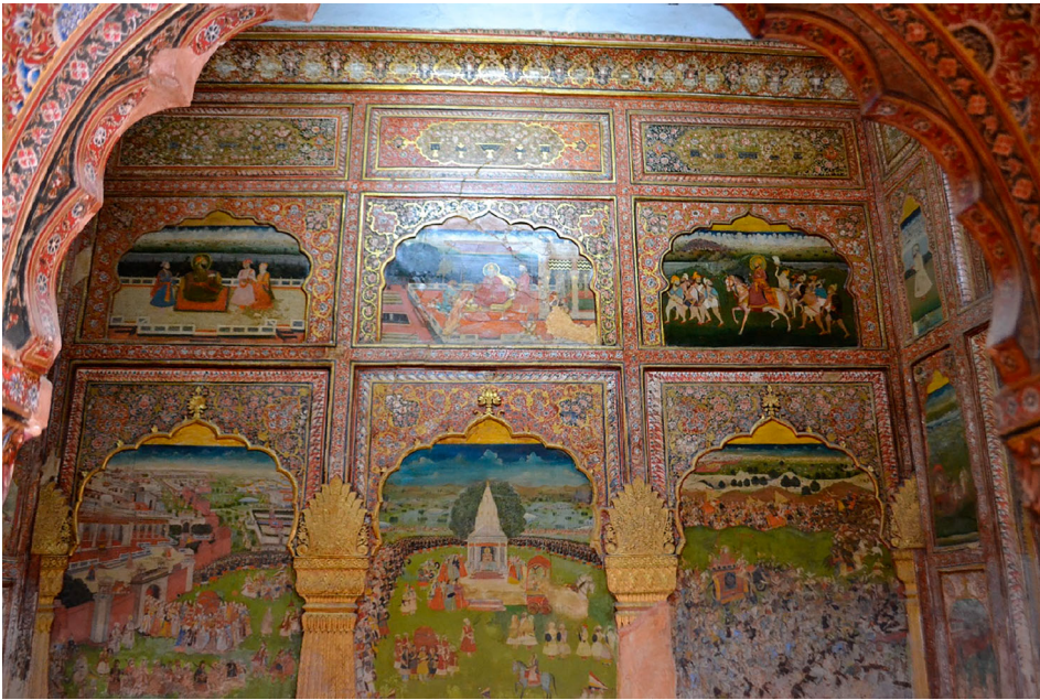
Figure 3. Three panels (below) about Krishna's abduction of Rukmini in the Audience Hall of Qila Mubarak, Patiala.