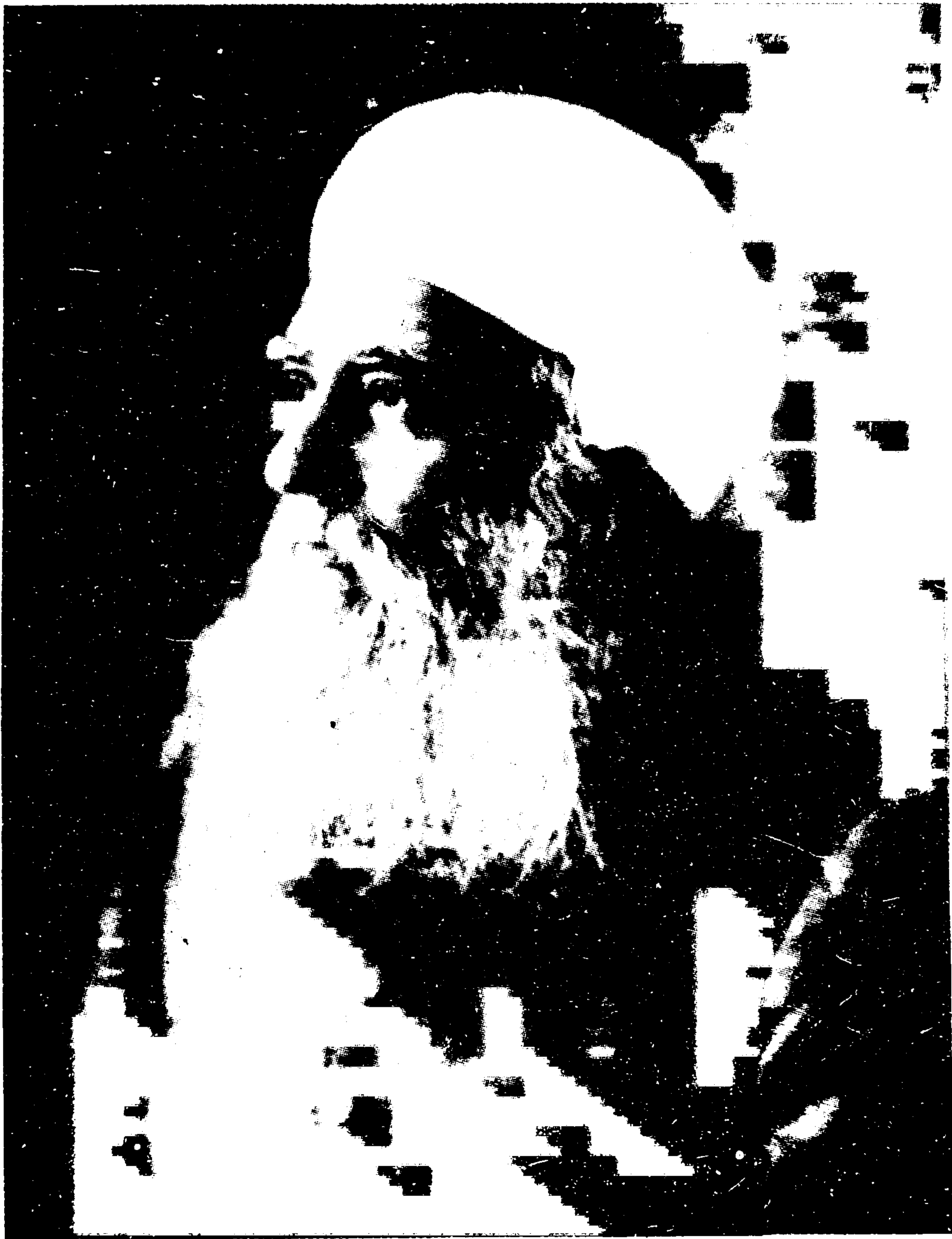
SARDAR BAHADUR SIR SUNDAR SINGH MAJITHIA (Feb. 17, 1872 - April 2, 1941)