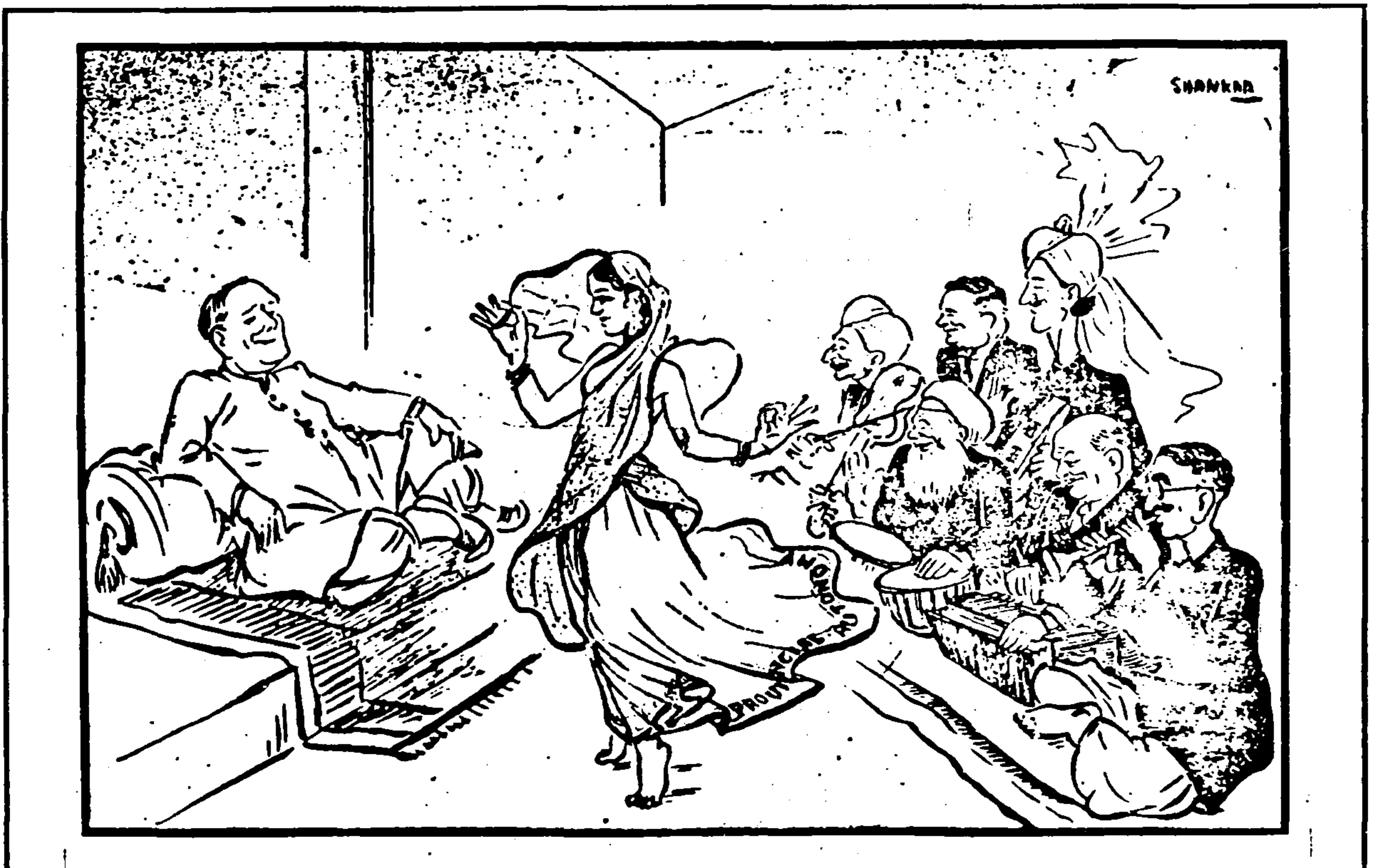
The cartoon depicts Sir Sundar Singh playing 'Tabla'; on his left is Sir Sikandar Hayat Khan accompanying him on harmonium and on his right is Chaudhry Sir Chhotu Ram along with other ministerial colleagues.

elections and Master Tara Singh's determination to win them besides avenging defeat in the Assembly elections as two major factors which forced him to criticise Sir Sundar Singh and his Party for participating in the Provincial Government, terming them as 'Sardar Bahadur Party'. A cartoon which appeared in 'The Hindustan Times' on July 19, 1937 illustrates the nature and extent of criticism these Ministerial colleagues in the Unionist Party had to face during that period.